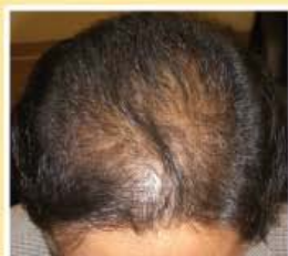
Male, 42 • Before