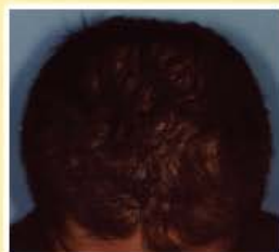
After 6 months