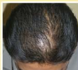
After 2 months