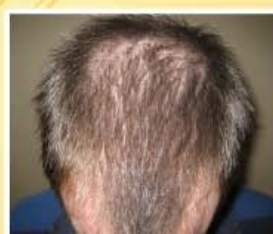
Male, 24 • Before