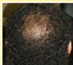
After 3 months