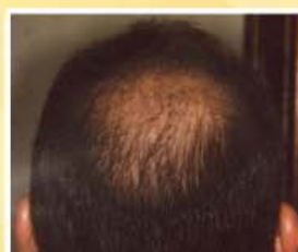
Male, 44 • Before