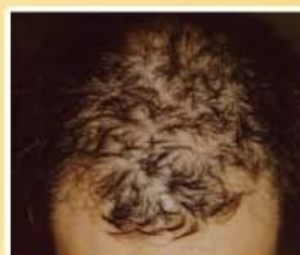
Male, 25 • Before