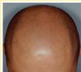
Male, 31 • Before