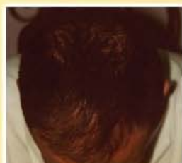
After 6 months