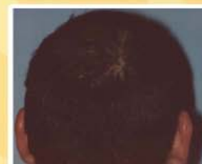
After 6 months