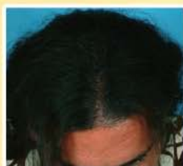
After 6 months