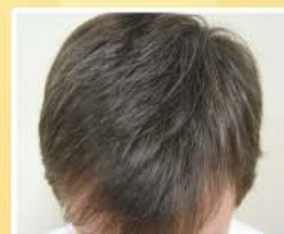
After 6 months