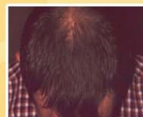
After 6 months