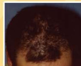
After 6 months