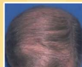
After 6 months