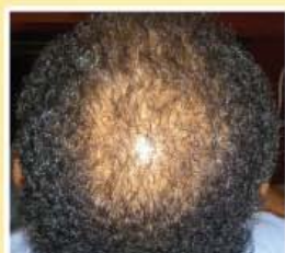
Male, 49 • Before