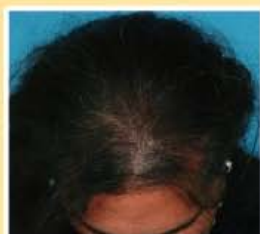
Male, 39 • Before

Patients were treated ONLY with Sunetics Lasers No Minoxidil (Rogaine™) • No Finasteride (Propecia™) No Transplants • No Other Therapies