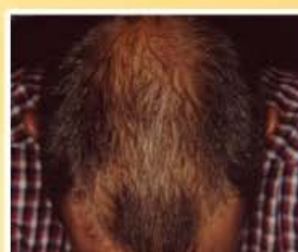
Male, 35 • Before