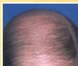
Male, 58 • Before